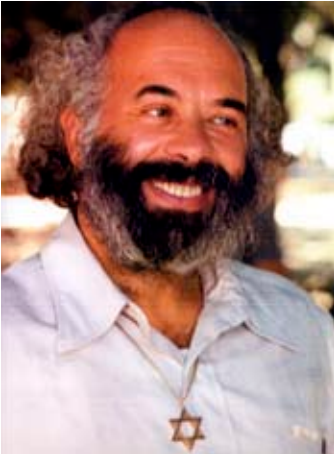
RABBI SHLOMO CARLEBACH